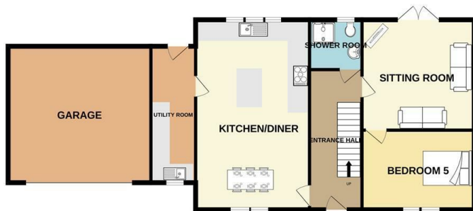
GROUND FLOOR 1137 sq.ft. (105.7 sq.m.) approx.