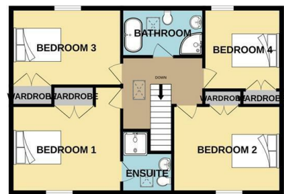
1ST FLOOR 767 sq.ft. (71.2 sq.m.) approx.